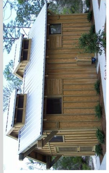
Using similar materials and design will create continuity of the types of structures built on city park properties. Pictured below - Restrooms

Heavy beams overhead will be strong enough to hoist boats up off floor when not in use for camp programs. Height from floor to bottom of beams will be at least 10' to allow plenty of clearance when boats are hoisted up. Ceiling fans, open rafters and vented areas will help draw air into building through open sliding doors while camps are in session during warmest months.